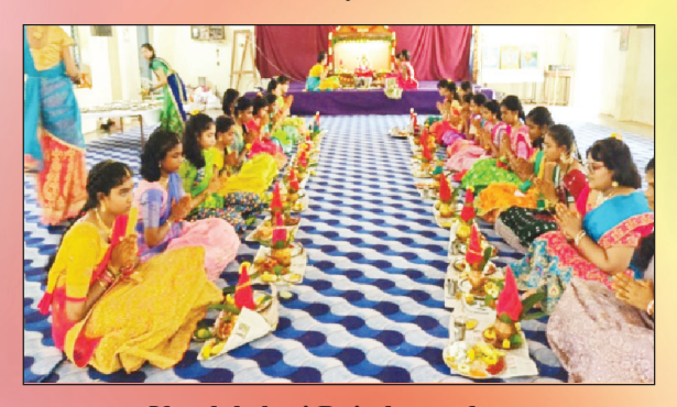
Varalakshmi Puja by students