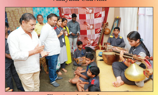
Fine Arts by Students